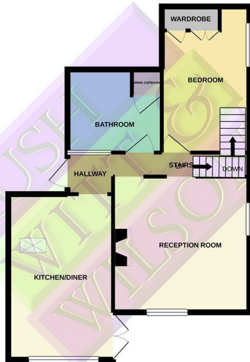
1ST FLOOR 622 sq.ft. (57.8 sq.m.) approx.